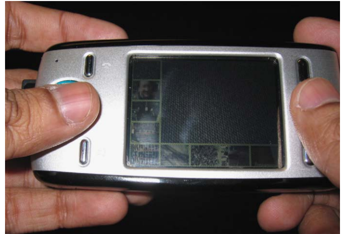
Fig. 3. The Motorola E680i running Mobiphos.

Our first version of the application kept all images at full resolution loaded in memory. This implementation worked well when testing the application on a desktop computer. However, the program become sluggish or unresponsive