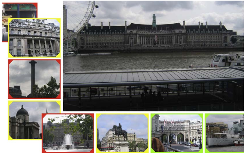
Fig. 1. A screenshot of the Mobiphos interface with the thumbnail timeline in mid-animation. The viewfinder is in the top-right and thumbnails are along the left and the bottom of the display. The colored border on the images indicates who captured the photograph. (For interpretation of the references to color in this figure legend, the reader is referred to the web version of this article.)